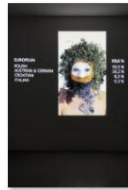
Evamaria Schaller, Becoming Native, 2019 (c) The Artist.jpg